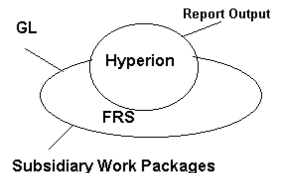
Figure 2 - Overall System Architecture

Hyperion provides "hot" links to the Hyperion Report Writer as well as other reporting tools such as Excel and Lotus. Links to other systems are possible by exploiting the openness of the system.